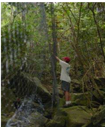
Taking a bird out of a net.

The birds held in these photos were caught for a study of the health of St. Martin's birds. A band with a number was placed on a leg so that the bird can be recognized if it is recaptured. This enables researchers to determine how many birds are here, how long they may live, when they breed, and other factors important to understanding the conservation needs of these species. Researchers in the North America are conducting similar studies and together we are piecing together the amazing phenomenon of migration and what birds need to survive.