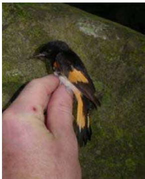
American Redstart Migrant