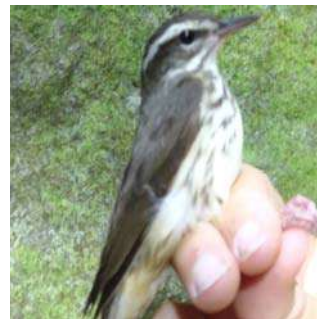
Louisiana Waterthrush Migrant