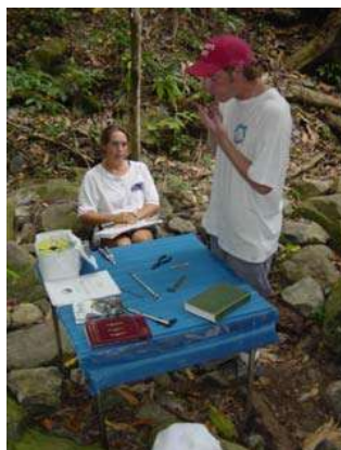
Recording data on a bird before releasing it.

Environmental Protection In the Caribbean would like to thank Lotterie Farm for allowing this study to take place and for its support of conservation on St. Martin.