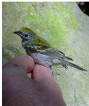
Chestnut-sided Warbler Migrant