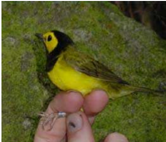
Hooded Warbler Migrant

Migrants come here to escape harsh winter weather. They fly hundreds or even thousands of miles back to their breeding grounds in North America for the spring and summer.