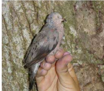
Ground Dove Resident