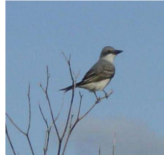
Gray Kingbird Resident