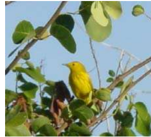
Yellow Warbler Resident

The birds held in these photos were caught for a study of the health of St. Martin's birds. A band with a number was placed on a leg so that the bird can be recognized if it is recaptured. This enables researchers to determine how many birds are here, how long they may live, when they breed, and other factors important to understanding the conservation needs of these species. Researchers in the North America are conducting similar studies and together we are piecing together the amazing phenomenon of migration and what birds need to survive.