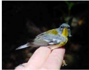
Northern Parula Migrant